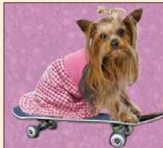
This dog is very cute and can be trained to do certain acts. She is a harmless lap dog and her name is PAGE.

Mad Advocates Creating Empowerment. Miffed at how teachers are treated.