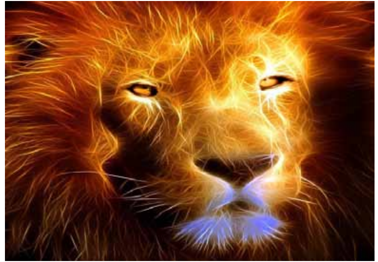
When you teach in a "jungle," have the Lion as your friend and defender.